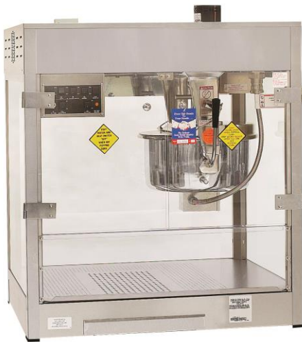
Operator Side View